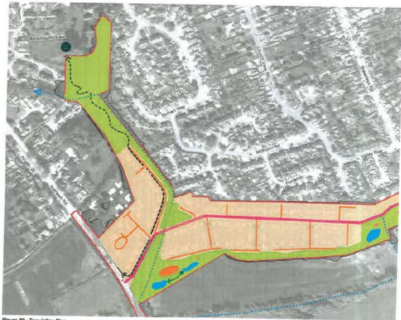
Figure 02 : Regulating Plan